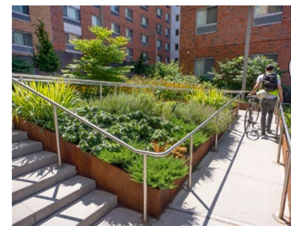
Green Walk precedent