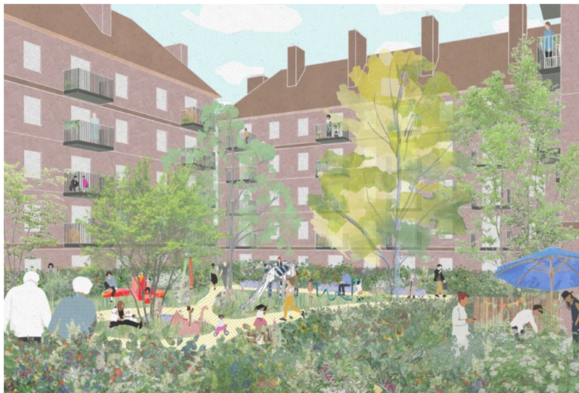
View into Barnsbury Road park