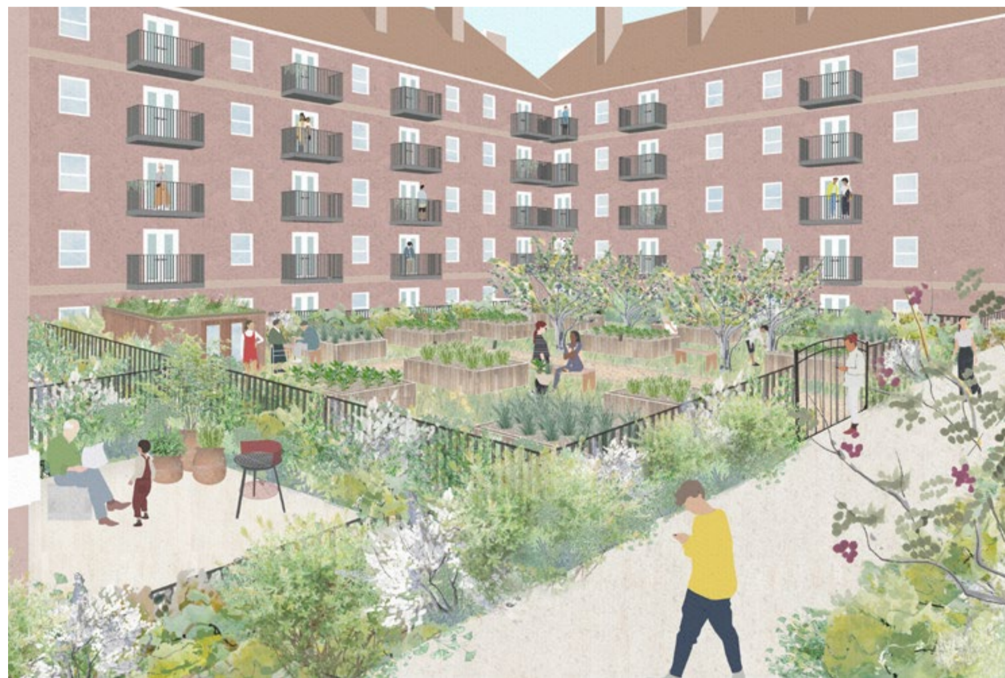
View of the improved community growing gardens