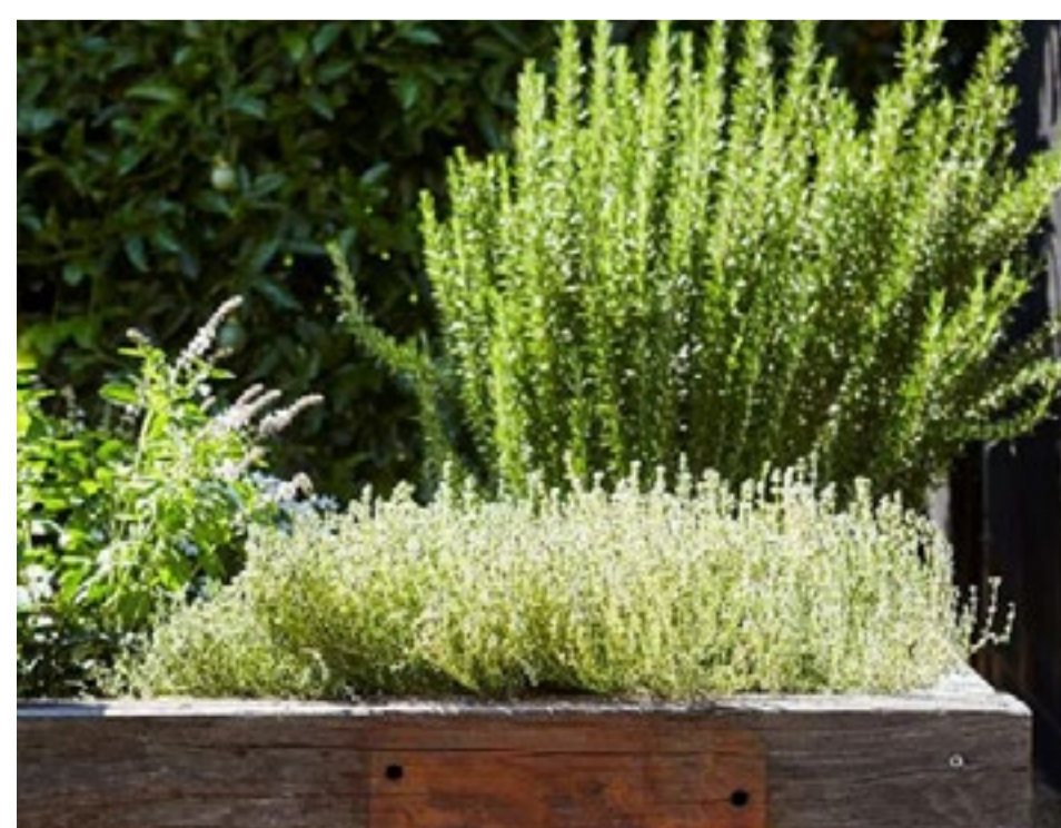
Community growing garden precedents