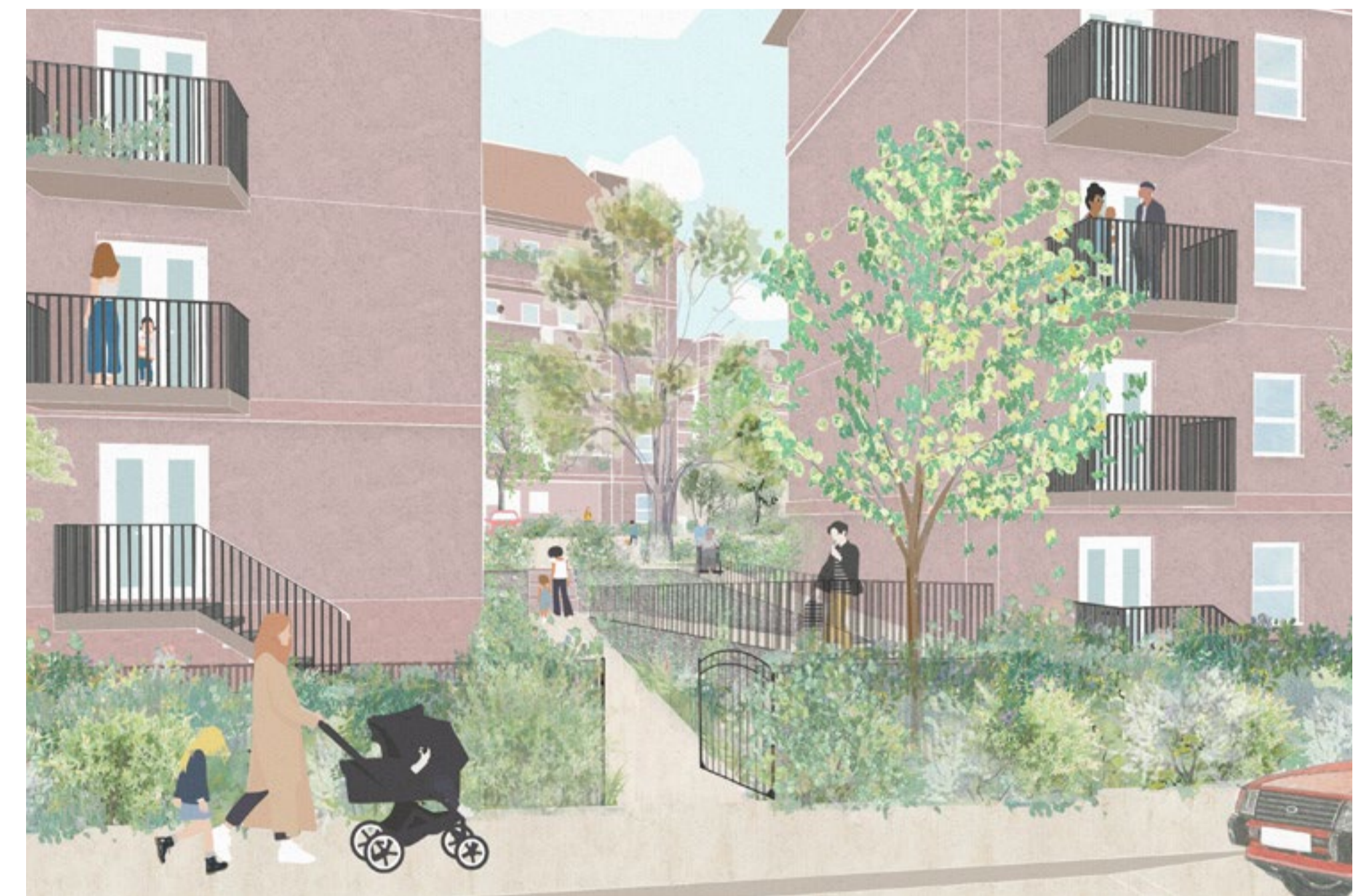
View of the accessible Green Walk from Charlotte Terrace