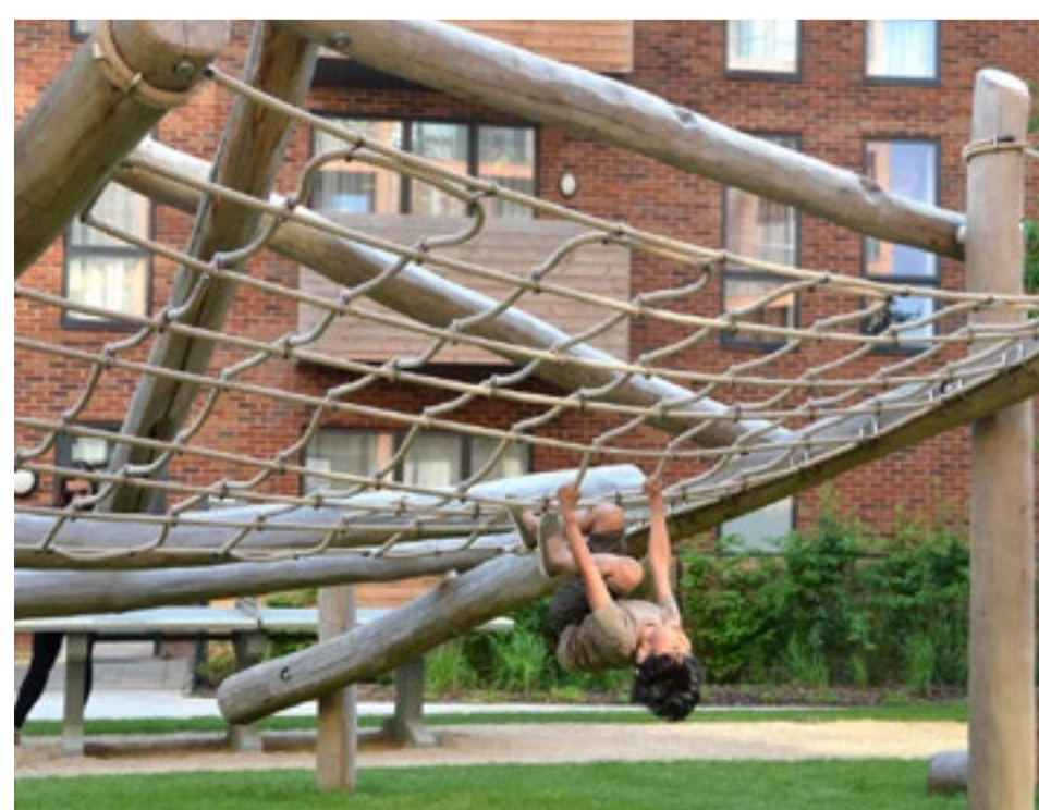
New equipment to play area