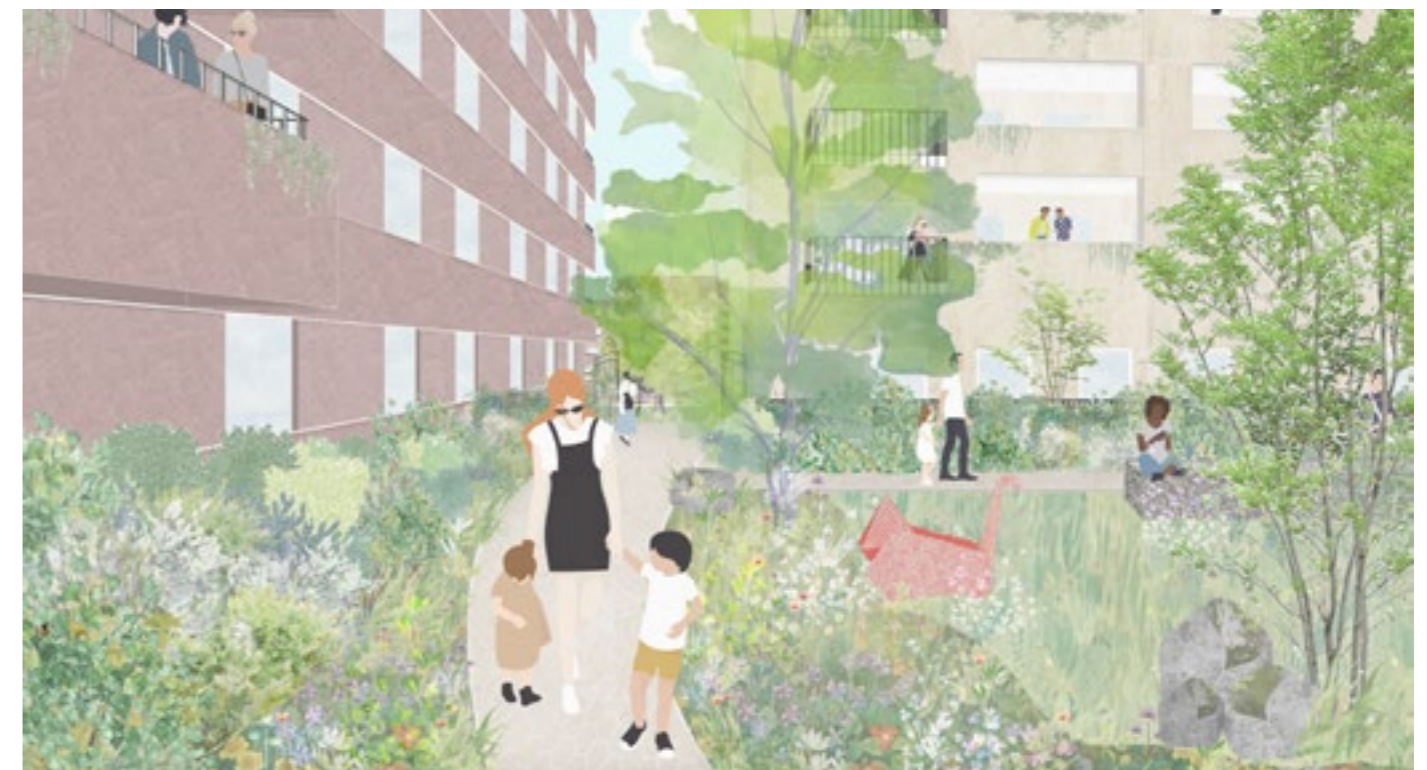
View of the Garden Walk which could pass through a shared courtyard and be locked to the public at night