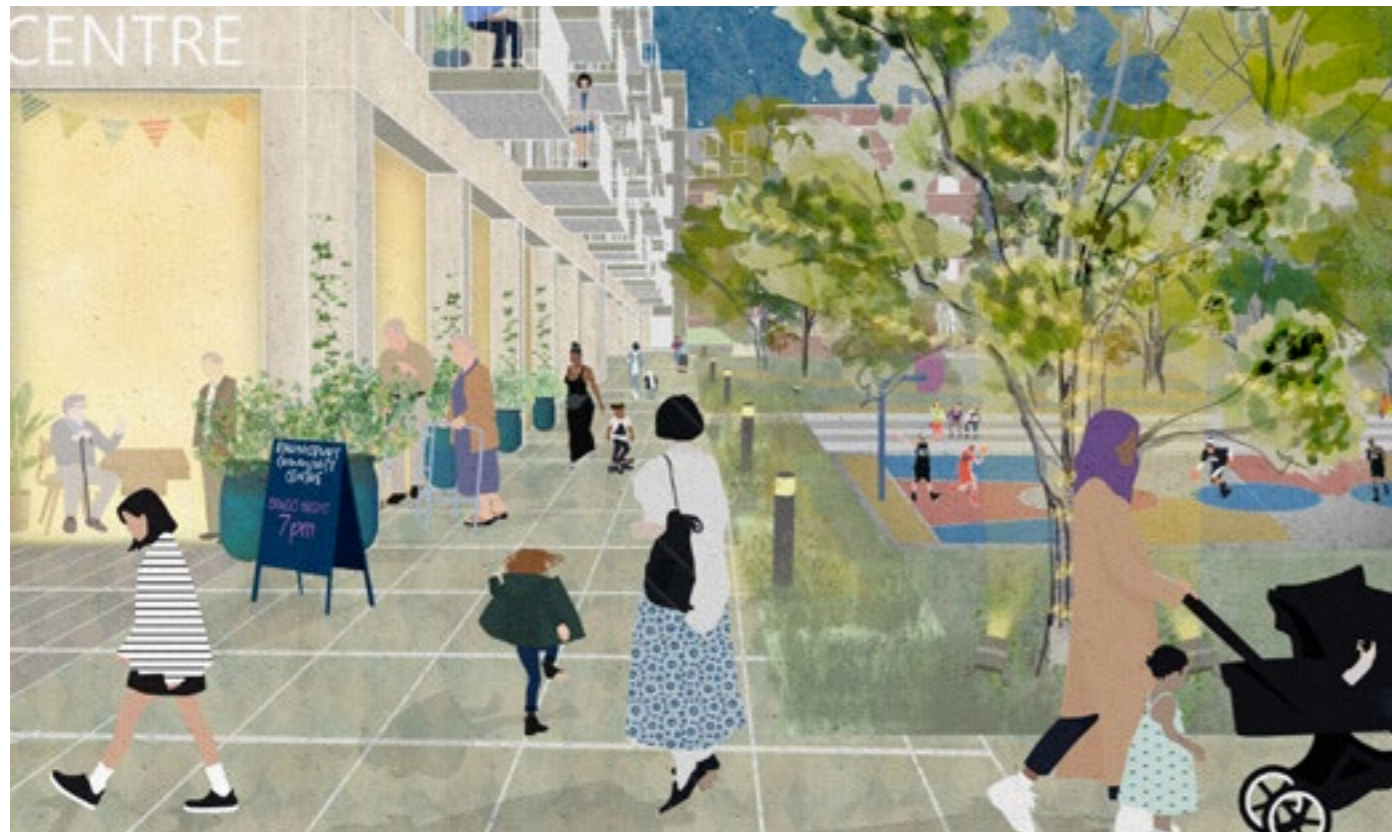
View of the new community centre and community park with a semi-sunken multi-use games area