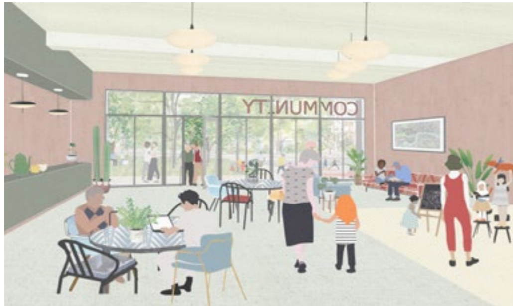
Proposed view from inside the new Community Hub

The Centre will open onto the new Community Park located along Carnegie Street which will provide activities for all ages including play and sports.