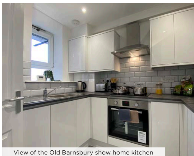
View of the Old Barnsbury show home kitchen

If you would like to book a slot to visit the show home then please contact 020 7613 7596 or 020 8709 9172 or email BEST@newlon.org.uk .