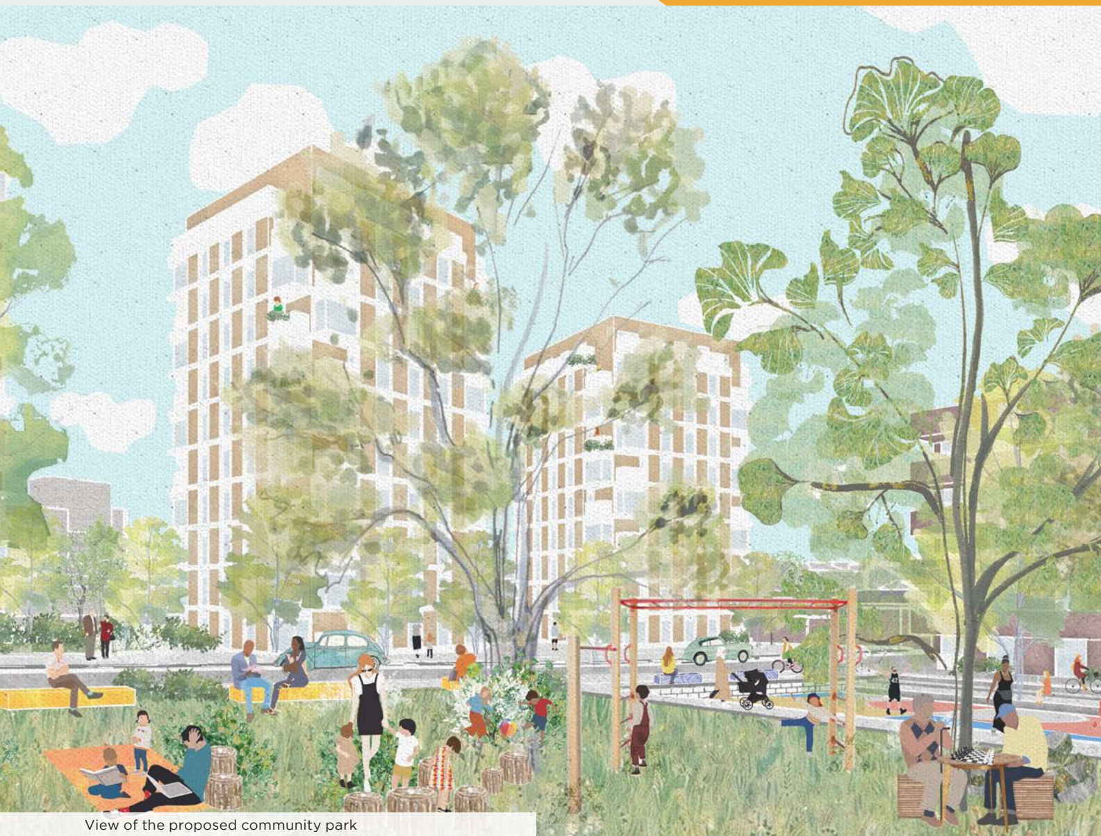
View of the proposed community park