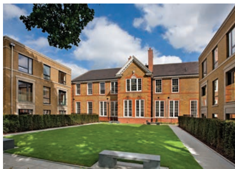
Barnsbury Place, N1 1EJ

In the meantime, there are three Mount Anvil sites within walking distance of the Barnsbury Estate, if you wanted to visit and take a look around in your spare time without a Mount Anvil or Newlon host. These are Barnsbury Place, Lexicon and The Loxfords.