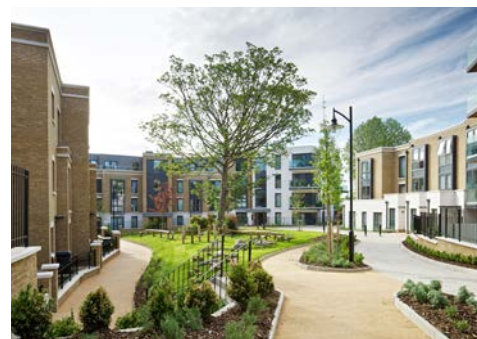
The Loxfords, N5 1GF