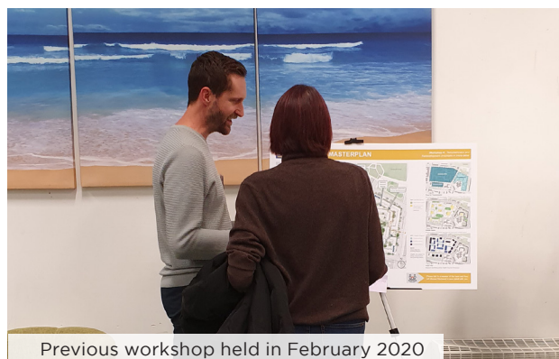
Previous workshop held in February 2020

If you would rather not speak to us in-person, you can call us on 020 7613 7596 or 020 8709 9172 and we can talk on the phone or organise an online meeting.