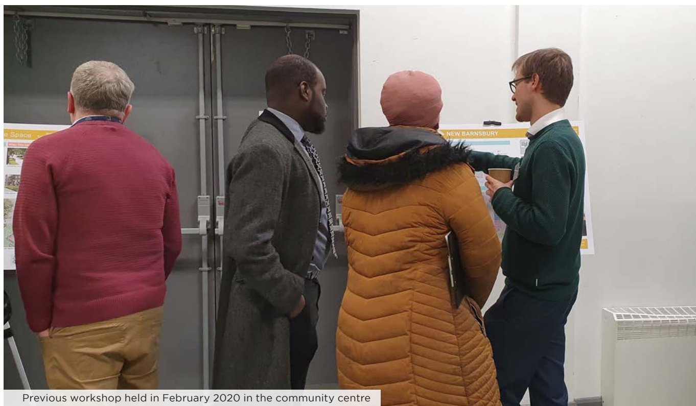
Previous workshop held in February 2020 in the community centre

Alternatively, you can contact your independent advisors, Source Partnership, by calling 020 8299 2550 or freephone 0800 616328 or by emailing info@sourcepartnership.com .