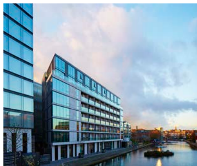
Lexicon, EC1V 1LE