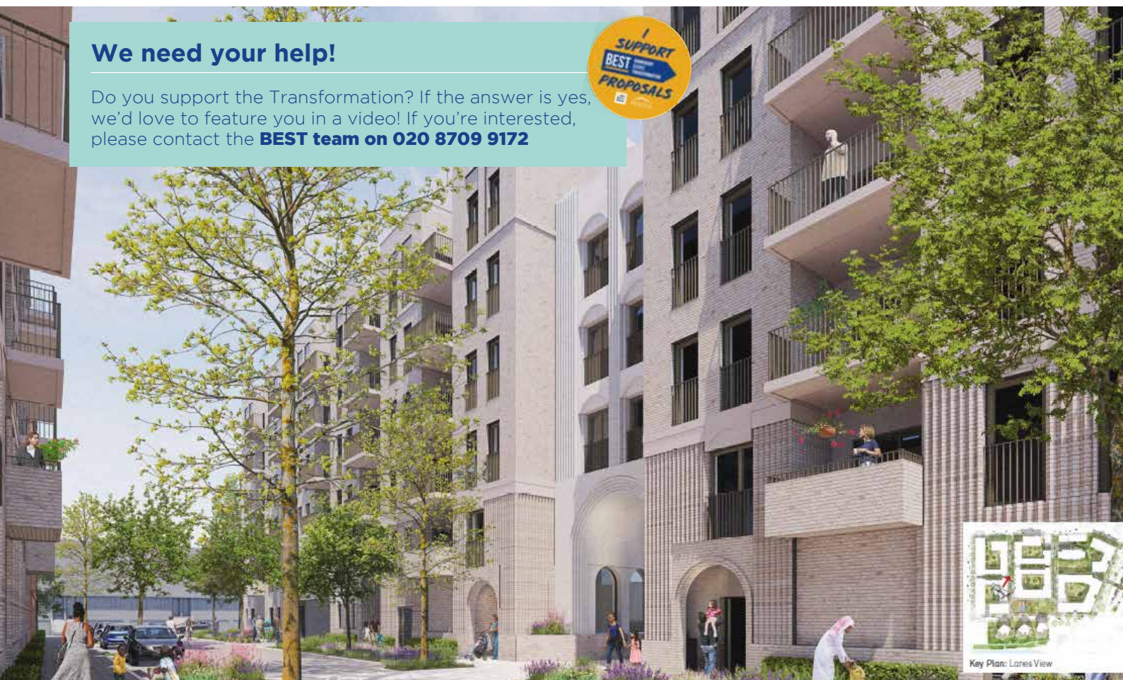
Proposed CGI of the Lanes