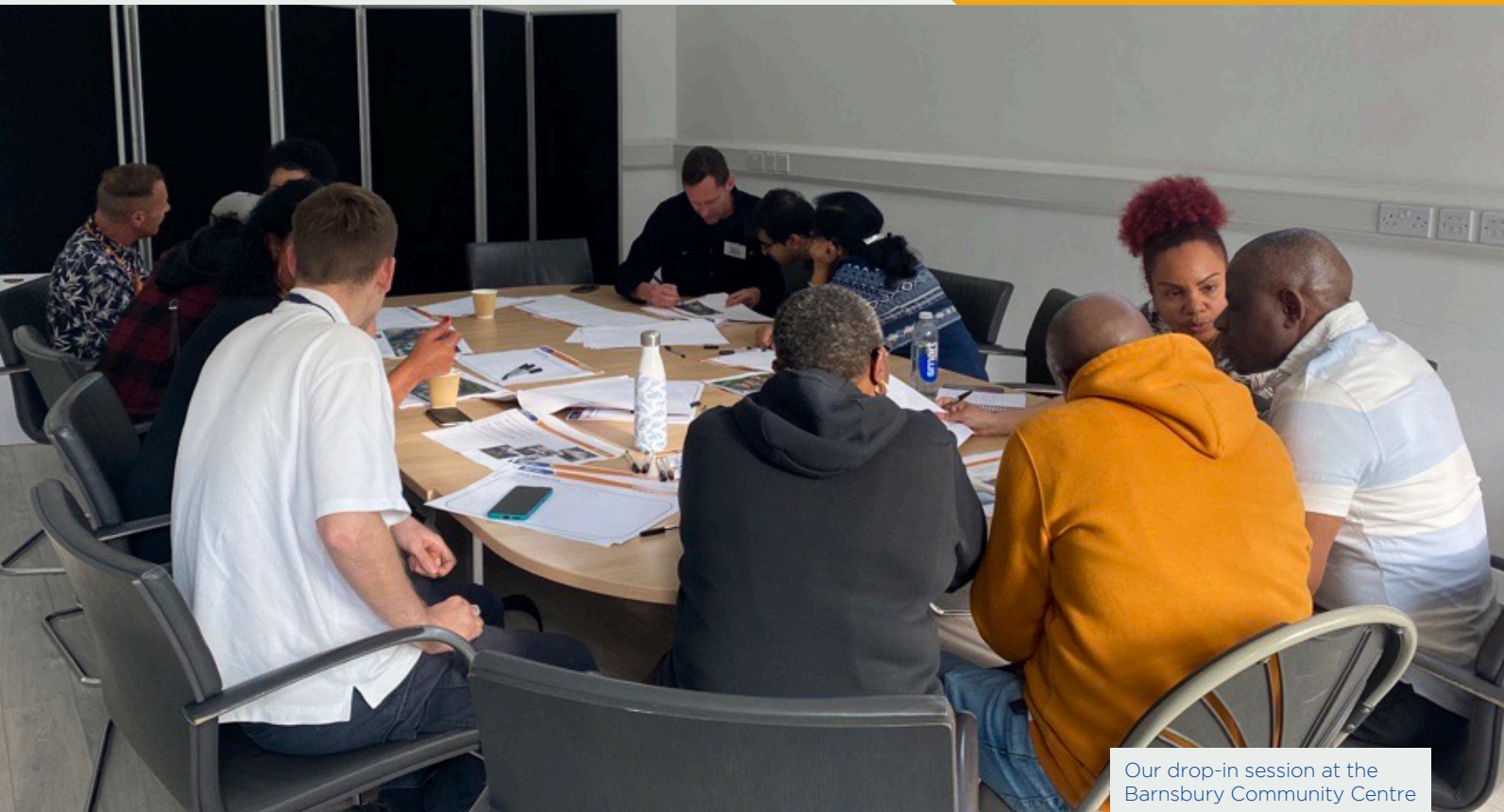
Our drop-in session at the Barnsbury Community Centre

Thank you to everyone that attended our recent events, where we talked about the proposed energy and sustainability works for Old Barnsbury.