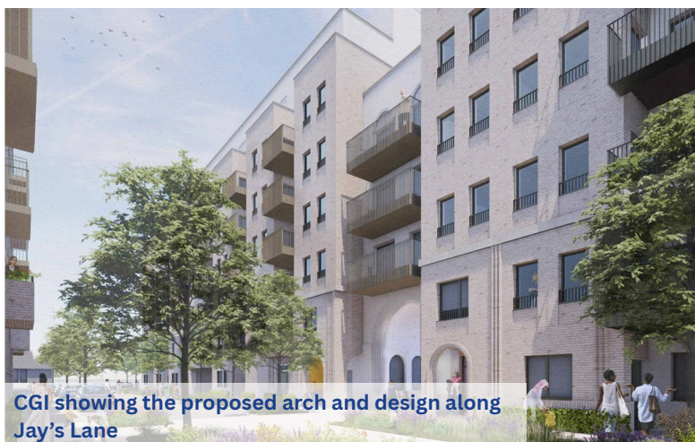
CGI showing the proposed arch and design along Jay's Lane