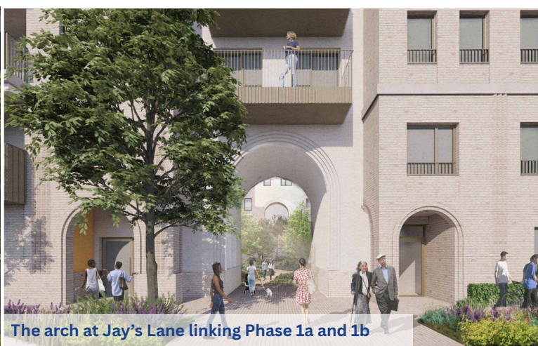
The arch at Jay's Lane linking Phase 1a and 1b