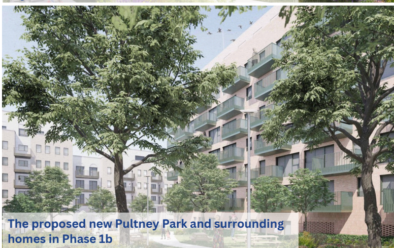
The proposed new Pultney Park and surrounding homes in Phase 1b