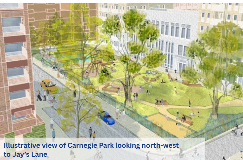
Illustrative view of Carnegie Park looking north-west to Jay's Lane