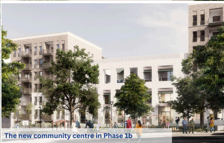
The new community centre in Phase 1b