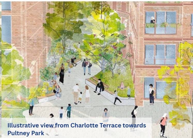
Illustrative view from Charlotte Terrace towards Pultney Park