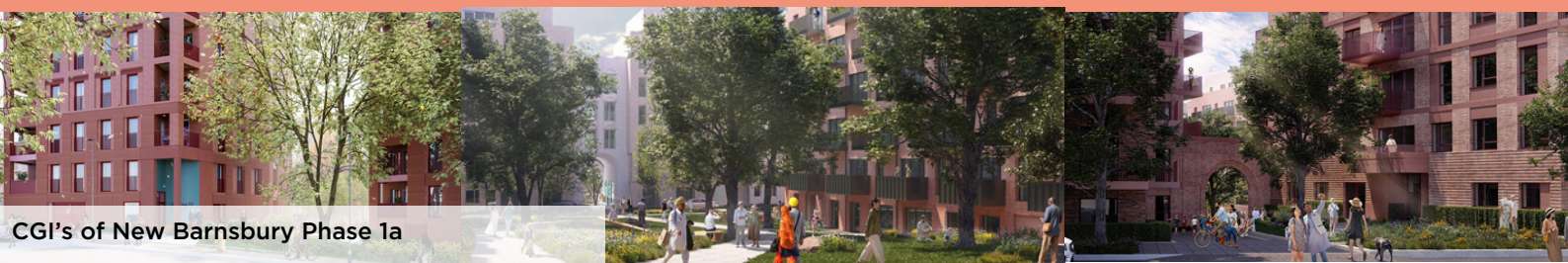
CGI's of New Barnsbury Phase 1a