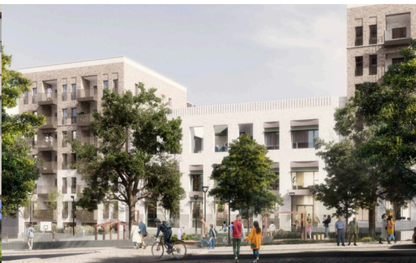
CGI's of New Barnsbury Phase 1a